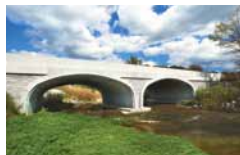
Corrugated Structural Plate