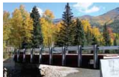
Wide Flange Shape